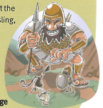
Bible story based on 1 Samuel 17

This was a day no-one would forget, when the courage of a shepherd boy saved a nation.