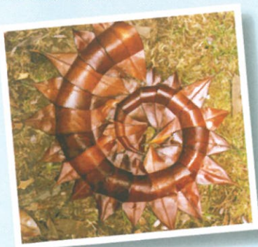
Leaves polished and greased, pinned to the ground with thorns.

Why don't you try making one next time you visit the coast?