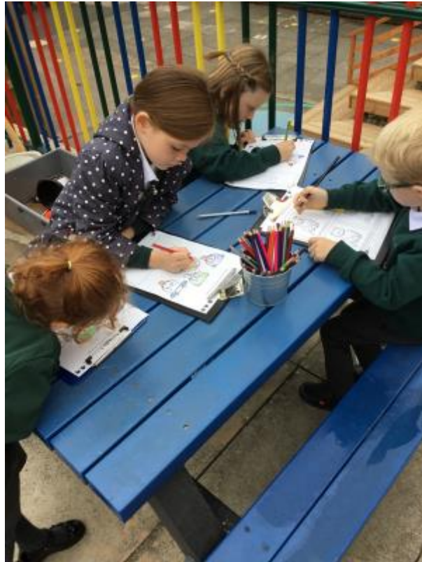
Wharfedale, Dentedale and Nidderdale